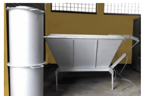
Picture: Optionally a two-stage filling system.

This door system is consisting of two gates: upper gate is a flap system opened and closed pneumatically. The lower gate is a horizontally sliding gate that is also actuated pneumatically. This gate moves into a closed room. If the feeding is done, the waste falling on to the lower gate. If the upper flap closes the lower gate will be slided horizontally and the waste fall down to the fire room. The lower gate is clad with fire resistant special concrete like inside the main combustion chamber.